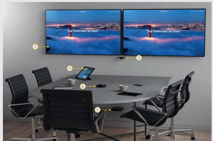
1. Two screens (wall-mounted) 2. Jabra PanaCast (mounted underneath or in between the screens, depending on eye level) 3. Control panel with Zoom Rooms 4. Jabra Speak 750 (placed in the center of the table) 5. Control unit compatible with the control unit (mounted underneath the table to hide the cables)

Jabra PanaCast integrates seamlessly and can simply be installed with any Zoom Rooms solution. Below is everything you need to ensure you get the best huddle room experience.